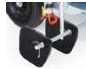
FieldLazer S90 Adjustable Spray Shield