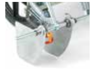
FieldLazer S100 Adjustable Spray Shield